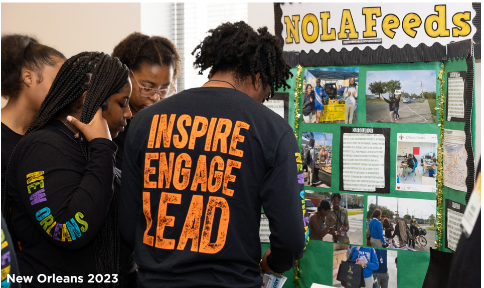
New Orleans 2023

Reflect thoughtfully on how you want to share your impact story. This is your chance to elevate both your community and your solution.