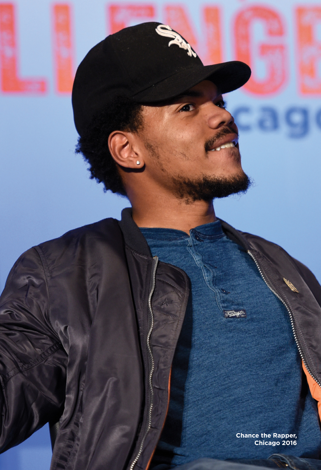
Chance the Rapper, Chicago 2016