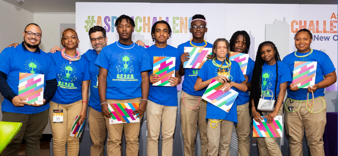
New Orleans 2023

* REMEMBER: When you complete Step 1, submit your team progress photo in the Innovation Lab. This photo could be a posed team shot, a candid of the team working together on Step 1 (interviewing each other, interviewing community members), or any other update you want to share. Don’t forget to take video, too! You may need the footage for the final presentation (HINT: Hope you appointed a Documentarian!).